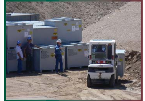
Workers place a metal box containing mixed low-level radioactive waste in a disposal cell at the Area 5 Radioactive Waste Management Complex located in the southeast portion of the NNSS.

Department of Defense sites across the country. Examples of this waste include contaminated construction debris, scrap metal, soil, and equipment. Some of this waste includes hazardous constituents. Waste is disposed in engineered cells