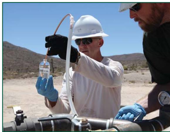
Hydrologists conduct water sampling at Well ER-6-2