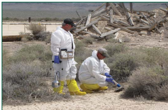
Radiation Control Technicians (RCTs) survey old radium dials in Area 5