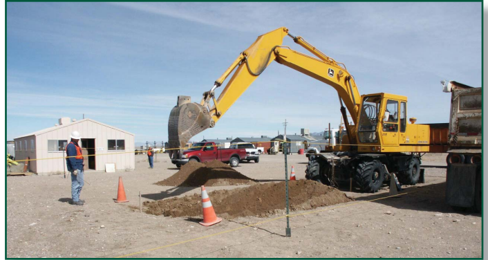
Soil excavation at a Contaminated Waste Site on the Tonopah Test Range.