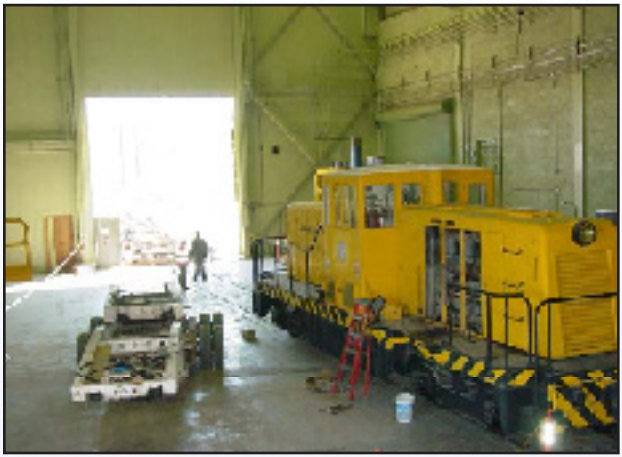
The 80-ton diesel-electric locomotive sits in the E-MAD as it is prepared for its journey.

During the height of operations in the 1960s, the Jackass & Western Railroad, located in Area 25 of the Nevada National Security Site (NNSS), formerly know as the Nevada Test Site (NTS), was the shortest and slowest operating railroad in the United States. However, it was the railroad's important