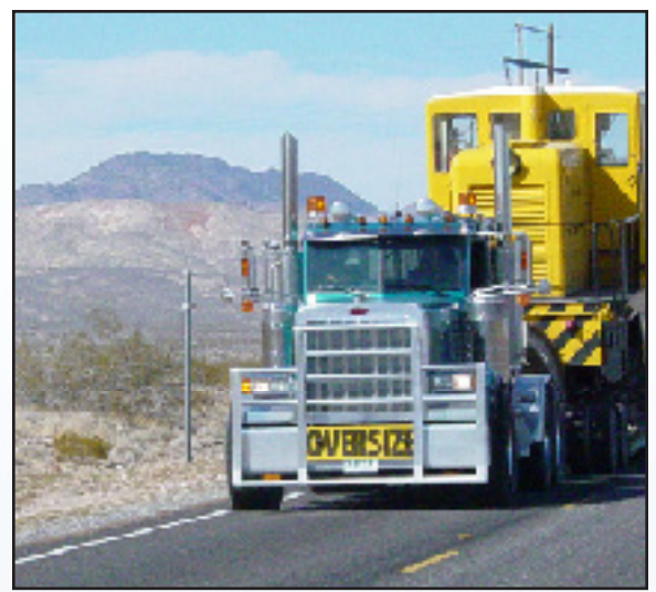
The locomotive leaves the NNSS on its way to the Boulder City Railroad Museum.

NNSA transferred ownership of the locomotive to the Nevada State Railroad Museum in April of 1997, and the locomotive was surveyed for contamination then released in August of the same year. The Railroad Museum was unable to relocate the locomotive due to funding limitations, but the Nevada State Legislature authorized funds for the relocation as part of the state's 2006 budget.