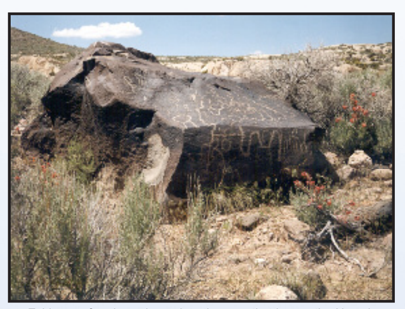
Evidence of early explorers into the area that is now the Nevada National Security Site, petroglyphs may be found in several areas of the site.

Peter Skene Ogden, an Englishman on a Hudson Bay Company trapping expedition down the Humboldt River, was the first white man to enter northern Nevada. It was 1826, and Nevada was the last state to be explored by the white man. Until that time, Nevada had been inhabited by Paleo-Indians and migrants. During the same year, the famous trapper-explorer Jebediah Smith crossed the southern tip of the state on his way to California. The Old Spanish Trail, Nevada's oldest, was first traveled by trappers and missionaries as early as 1829. Trail blazing was active during the 1840's with the establishment of the Bidwell Trail across northern Nevada in 1841, explorations by John C. Fremont from 1843 through 1845, and the ill-fated Donner Party in 1846. Despite a considerable amount of travel across the state, it was not until 1849 that the first permanent settlement was established by a group of Mormons at Mormon Station, later to be called Reese's Station, renamed Genoa in 1856, a name it still retains.