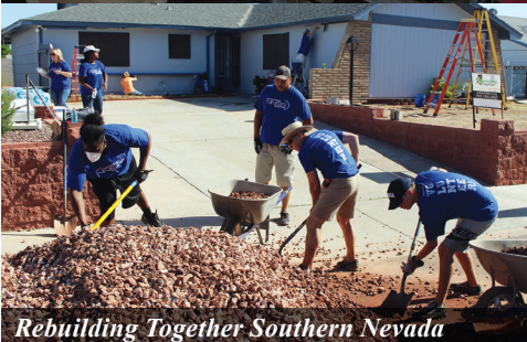
Rebuilding Together Southern Nevada