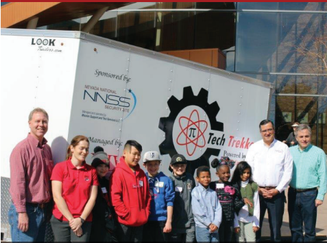
UNLV Tech Trekker sponsored by the NNSS.