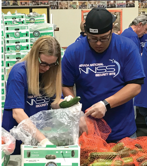
Three Square Food Bank