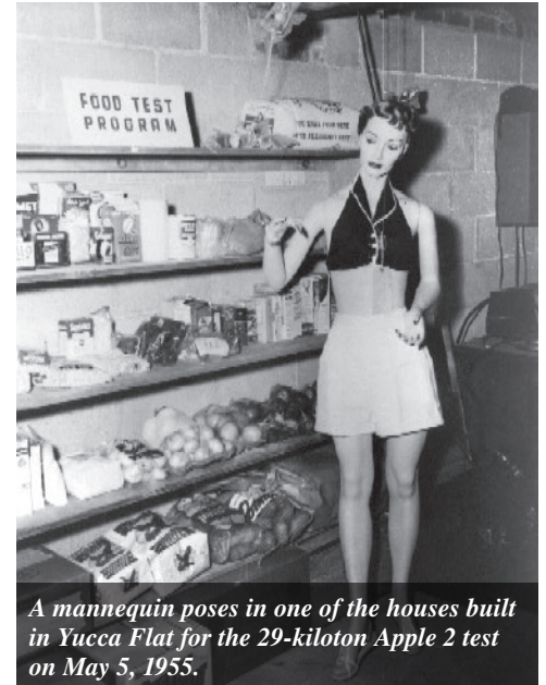
A mannequin poses in one of the houses built in Yucca Flat for the 29-kiloton Apple 2 test on May 5, 1955.

The two-story homes, which still stand today, were subjected to a pressure of