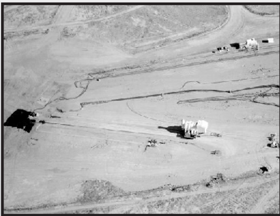
An aerial view of the Huron King test chamber (right) moments before the test in 1980.

conducted at the Nevada Test Site on June 24, 1980 by the Defense Nuclear Agency, now the Defense Threat Reduction Agency (DTRA), U.S. Department of Defense.