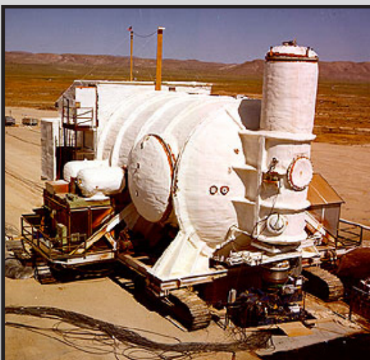
The Huron King test chamber is still located in Area 3 of the Nevada National Security Site.

For more information, contact: U.S. Department of Energy National Nuclear Security Administration Nevada Field Office Office of Public Affairs P.O. Box 98518 Las Vegas, NV 89193-8518 phone: 702-295-3521 fax: 702-295-0154 email: nevada@nnsa.doe.gov http://www.nv.energy.gov