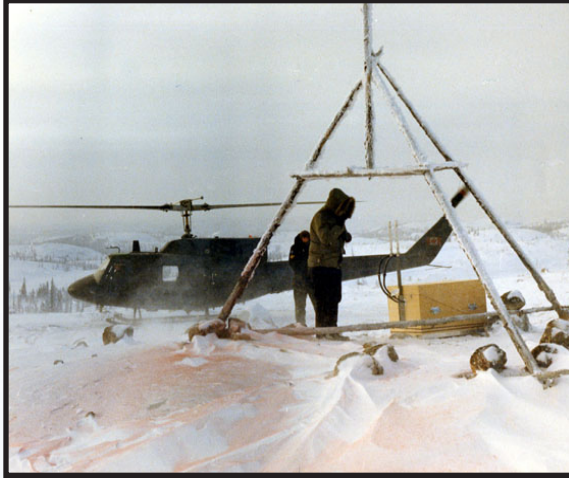
A microwave ranging transponder unit is placed under a landmark. The distance limitations of the units meant constant movement was necessary as the search moved along the footprint.