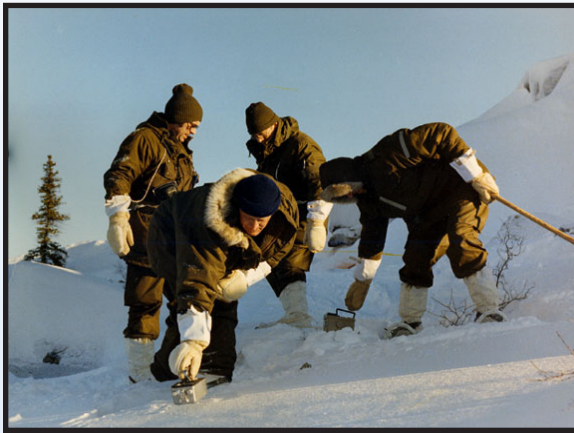
Team members, dressed in specially designed arctic clothing, begin the painstaking process of searching the area with hand-held radiation detectors.