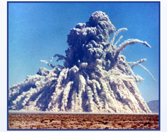
As part of the Plowshare Program, Sedan tested excavation capabilities of nuclear weapons for peaceful purposes.

July—Project Sedan, a Plowshare Program test, is conducted at the Nevada Test Site. It forms a 1,280-foot diameter by 320foot deep crater.