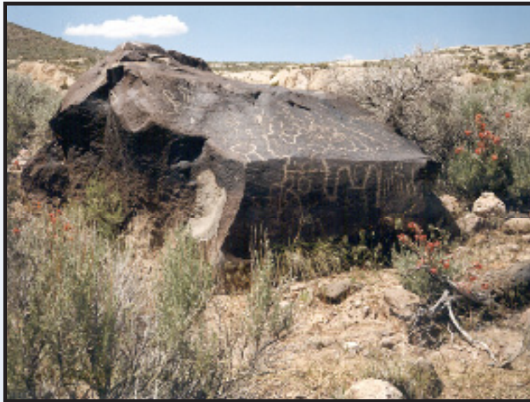
Evidence of early explorers into the area that is now the Nevada National Security Site, petroglyphs may be found in several areas of the site.

Peter Skene Ogden, an Englishman on a Hudson Bay Company trapping expedition down the Humboldt River, was the first white man to enter northern Nevada. It was 1826, and Nevada was the last state to be explored by the white man. Until that time, Nevada had been inhabited by Paleo-Indians and migrants. During the same year, the famous trapper-explorer Jedediah Smith crossed the southern tip of the state on his way to California. The Old Spanish Trail, Nevada's oldest, was first traveled by trappers and missionaries as early as 1829. Trail blazing was active during the 1840's with the establishment of the Bidwell Trail across northern Nevada in 1841, explorations by John C. Fremont from 1843 through 1845, and the ill-fated Donner Party in 1846. Despite a considerable amount of travel across the state, it was not until 1849 that the first permanent settlement was established by a group of Mormons at Mormon Station, later to be called Reese's Station, renamed Genoa in 1856, a name it still retains.