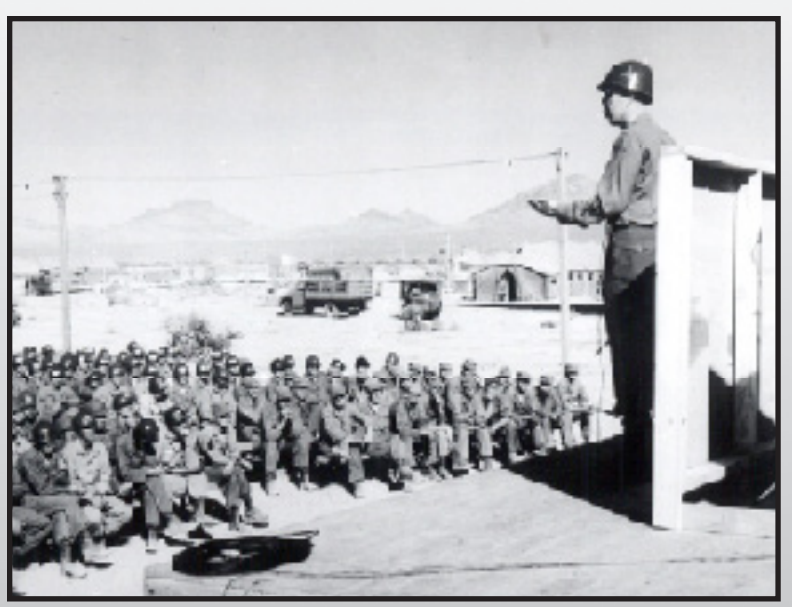
Soldiers are briefed at Camp Desert Rock for an atmospheric nuclear test on Yucca Flat. It was the fourth test in the Buster-Jangle series, and the fourth test where military personnel were deployed from Camp Desert Rock.

Starting in 1951, thousands of military personnel from all four U.S. military services