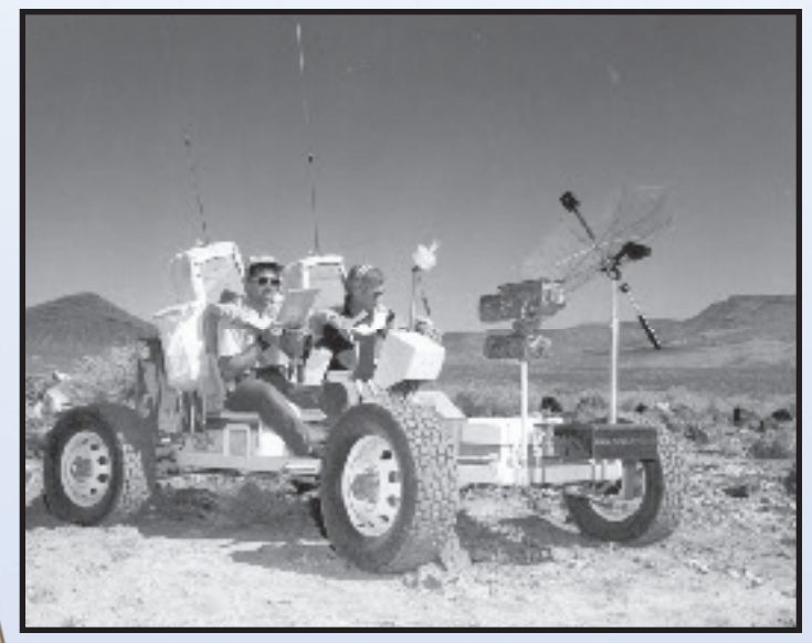
Apollo 16 astronauts in a moon rover in November 1970 near Schooner crater.