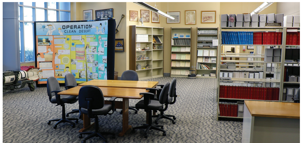
The public has access to more than 400,000 historical documents, records, and data in relation to nuclear testing documents at the Nuclear Testing Archive.

The Freedom of Information Act (FOIA), enacted in 1966, allows individuals or organizations access to government records. The DOE's National Nuclear Security Administration/Nevada Field Office established the Coordination and Information Center – now referred to as the Nuclear Testing Archive – on July 17, 1981, to collect and make available all historical documents, records and data