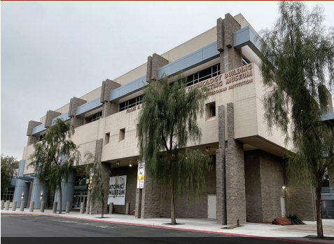
The Nuclear Testing Archive is located on Flamingo Road in Las Vegas.