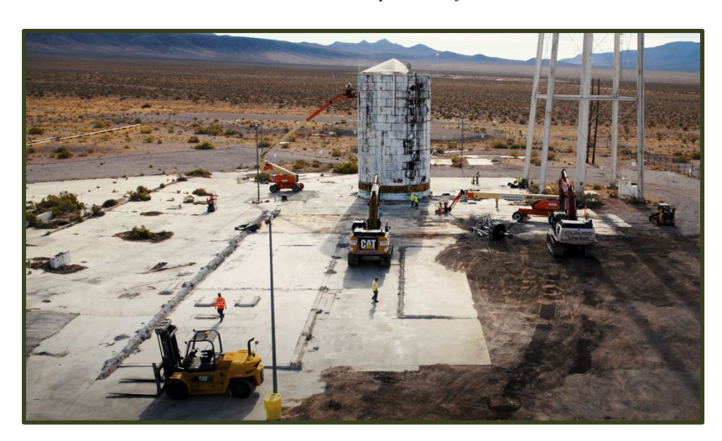
TCC Demolition Update – After