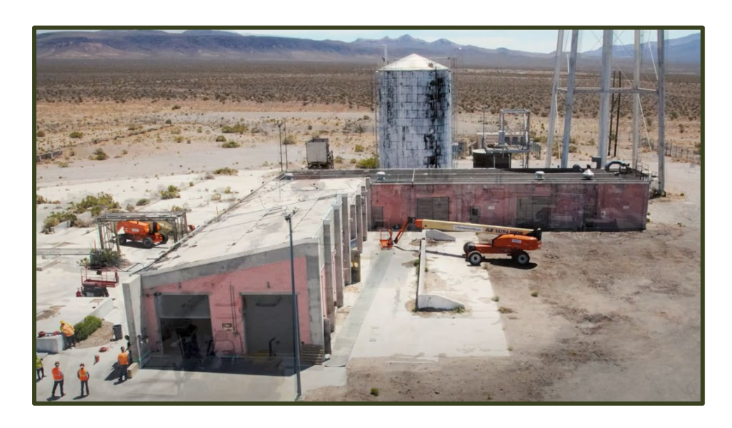
TCC Demolition Update - Before