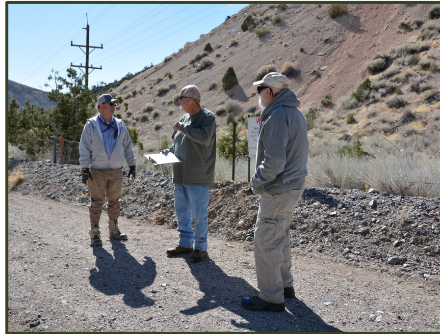
NSSAB observed long-term monitoring activities at Area 12, E Tunnel