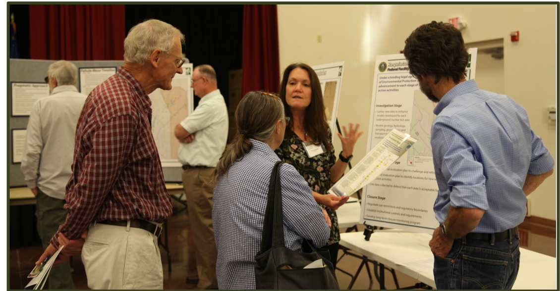
Groundwater Open House - archive