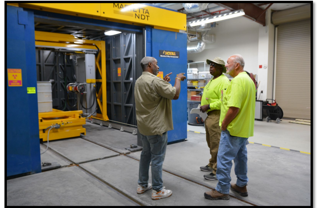
NSSAB visit the RTR