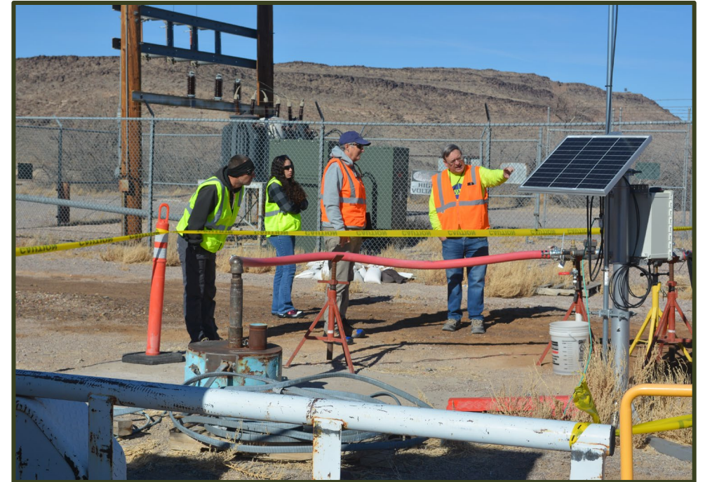
Sampling of well WW-C-1