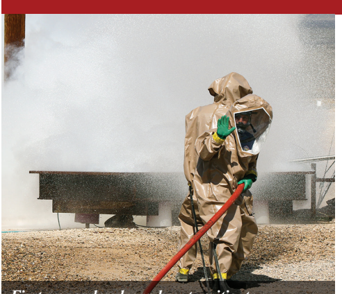
First responders learn how to mitigate a hazardous chemical spill using firefighting foam.

NPTEC provides secure testbeds, logistics, calibrated release systems, weather data, ground-truth instrumentation, support for partners during project execution, and an aircraft take-off and landing strip on Frenchman Flat.