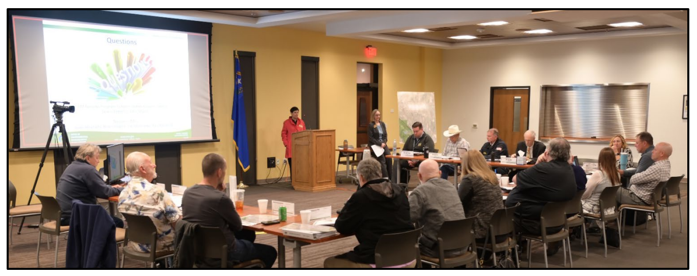
NSSAB meeting hosted in Pahrump on January 15, 2025

Hosted NSSAB Full Board Meeting via hybrid format in Pahrump, NV, including social media, news release with almost 42K subscribers, notifications to libraries in southern Nevada, and newspaper advertising in LV Review-Journal and Pahrump Valley Times for promotion – January 15, 2025