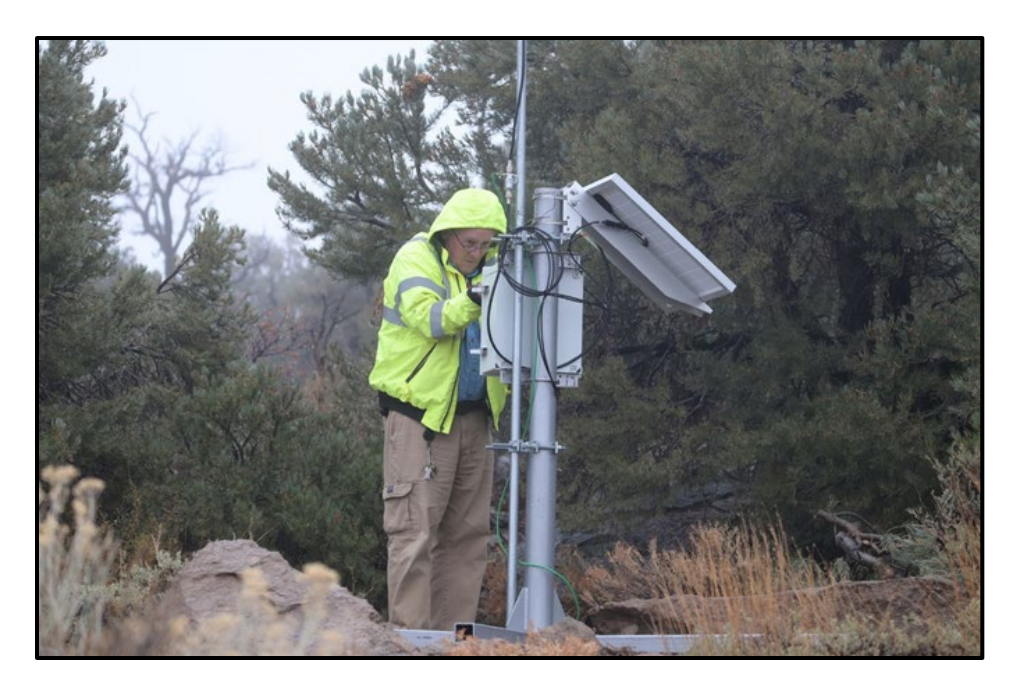
New equipment aids groundwater data collection, more information can be accessed <u>here</u>

In January 2025, development of the calendar year 2024 post-closure monitoring letter report for all closed groundwater CAUs began.