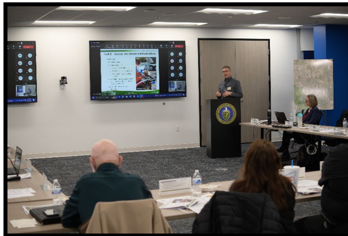
Photos from NSSAB Meeting held on February 19, 2025