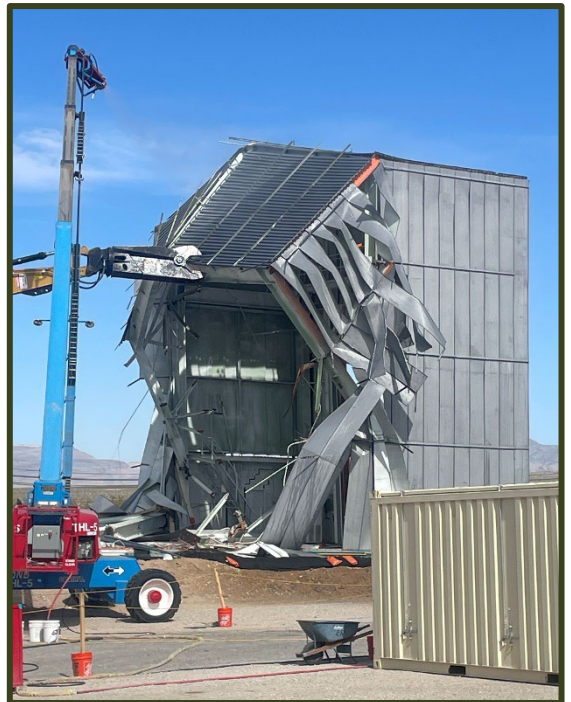
Last section of the trainshed coming down at EMAD Facility.

CAU 114 comprises three Corrective Action Sites (CASs) in Area 25 of the NNSS. The Streamlined Approach for Environmental Restoration (SAFER) Plan was approved by NDEP in June 2021. Preparation of the facility for eventual demolition continued and demolition of Building 3901, the trainshed, was completed in April 2025.