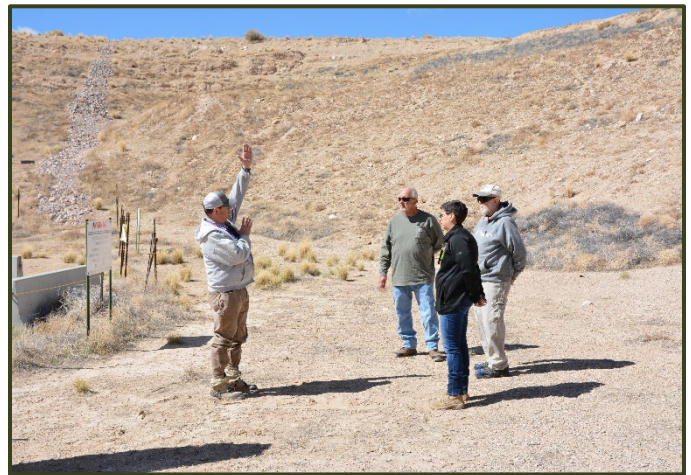
Below: NSSAB members observe post-closure monitoring activities at Area 9, Player.