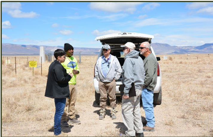
Above: NSSAB members observe post-closure monitoring activities at Area 3, Tejon.