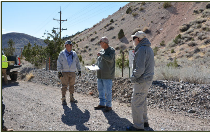
Left: NSSAB members observe post-closure monitoring activities at Area 12, E-Tunnel.