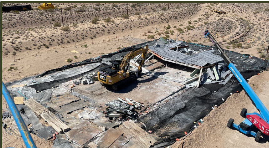
Aerial view of the trainshed at EMAD Facility at the end of April 2025.