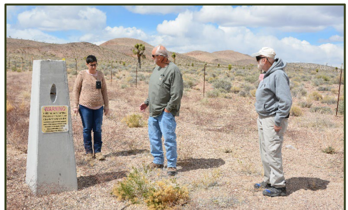
Right: NSSAB members observe post-closure monitoring activities at Plutonium Valley.