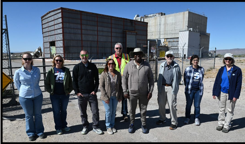
Above: NSSAB observed significant advancements in demolishing the EMAD cold bay. Below: NSSAB were briefed on the new drive-through truck portal.