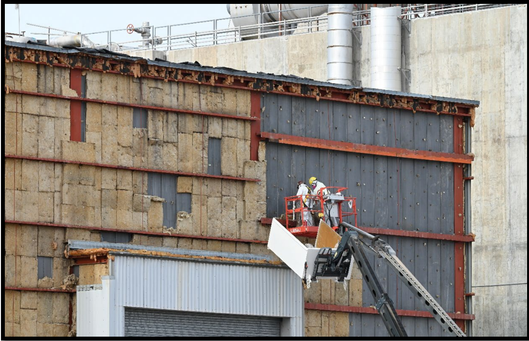
Below: Insulation removal at EMAD Cold Bay – March 2026