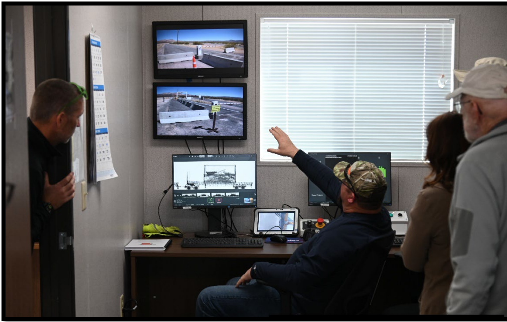
Above: NSSAB observed the inner workings of the drive-through truck portal. Below: NSSAB examined rock cuttings collected every ten feet during the recent well drilling campaign.