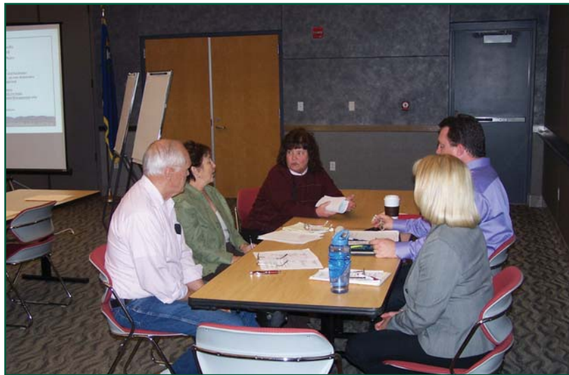
The Nevada Site Specific Advisory Board provides recommendations on budget prioritization to the Nevada Field Office Environmental Management Program.

The DOE National Nuclear Security Administration Nevada Field Office Environmental Management Program develops and maintains life-cycle baselines to assist planning and budget efforts. These comprehensive documents contain the proposed work scope, cost, and schedule necessary to meet technical and regulatory commitments for the duration of each activity in the Environmental Management Program. Baselines are created using cost estimates based on industry standards, current performance, past performance on similar activities, and fixed-price quotes. This information is used to estimate the cost of specific tasks anticipated for future projects. Assembling detailed estimates for these tasks leads to the development of a total project estimate. The Nevada Field Office evaluates and updates as necessary the baselines each year as part of its annual planning and budgeting activities, to incorporate changes to estimates resulting from factors such as new technology, stakeholder issues and concerns, available funding, new and/or revised corrective action strategies, and regulatory requirements.