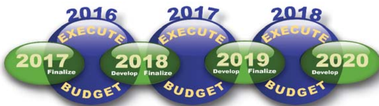
Example of U.S. Department of Energy budget planning timeline.

People often develop budgets as part of their job or for their own personal finances. For many people, this can be a difficult process. Imagine the difficulty of creating detailed budgets two years in advance of when you actually need the money! As an example, in fiscal year (FY) 2016, the U.S. Department of Energy (DOE) will simultaneously develop budget plans for FY 2018; refine previously developed plans for FY 2017 (submitted in FY 2015); and execute the approved budget plan for FY 2016 (initiated in FY 2014). DOE Headquarters works with these different budgets throughout the year as it evaluates funding requests from DOE field sites across the United States. Given the complexity of this ongoing, multi-phase process, the DOE takes a comprehensive approach to ensure that the most critical issues at each site are addressed and adequate funding is allocated on a timely basis.